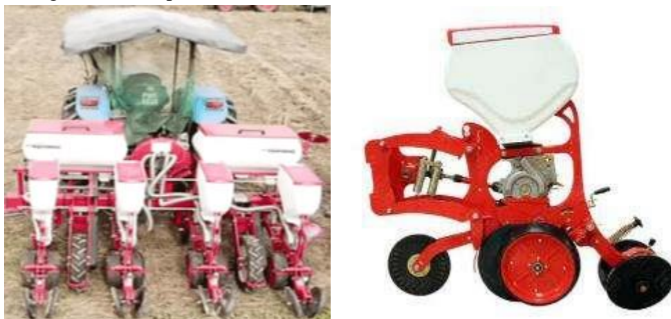
Figure 3. Planting machine used in the study

All the plots were planted on the same day by using one machine, a 4-row pneumatic seeding machine specially designed for the zero-tillage planting system as shown in Figure 3.0. The machine has a special mechanism or component to penetrate no-tilled and tilled soil to sow corn seed. The machine is equipped with a fertiliser applicator that enables the fertilising concurrently during the planting operation. The fertiliser applicator is equipped with two hoppers that can hold up to 200 kg of granular-type fertiliser each. It also has four fertiliser metering devices for regulating the fertiliser rate needed by the plants based on agronomist recommendations. The machine was operated with the same tractor used for operating the tillage implement. The travelling speed of the planting operation was set between 4 and 5 km/h. Before planting, the equipment was calibrated to ensure that the seeds and fertilisers were sown throughout the operation. This is important to reduce the risk of yield shortages due to unplanted seeds.