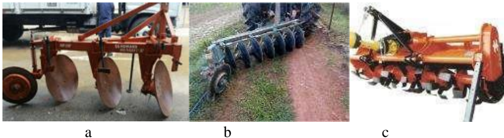
Figure 2. Tillage operation, (a). Disc plough; (b.) Disc harrow; (c.) Rotavator

Herbicide spraying was used to eradicate weeds from both plots before land preparation. The herbicide used was glyphosate, a nonselective systemic herbicide, particularly effective against perennial weeds that can kill both broadleaf plants and grasses. The plot was left over for about 2 weeks to ensure all weeds were killed and to prevent any adverse effects of the herbicide on corn crops.