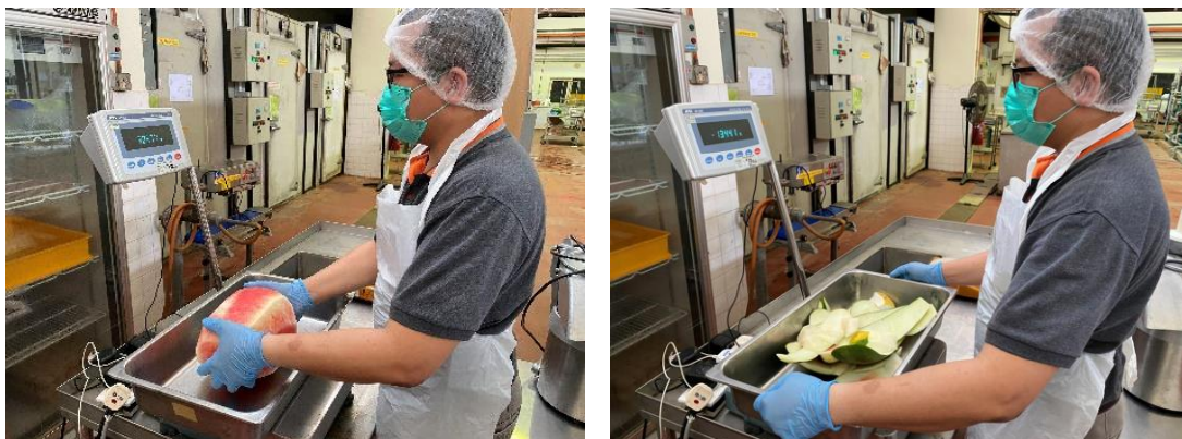
Figure 3. Watermelon flesh and rind weighing process