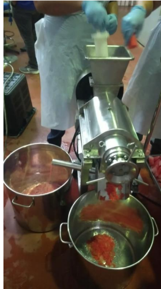
Figure 4. Watermelon extracting process using the machine