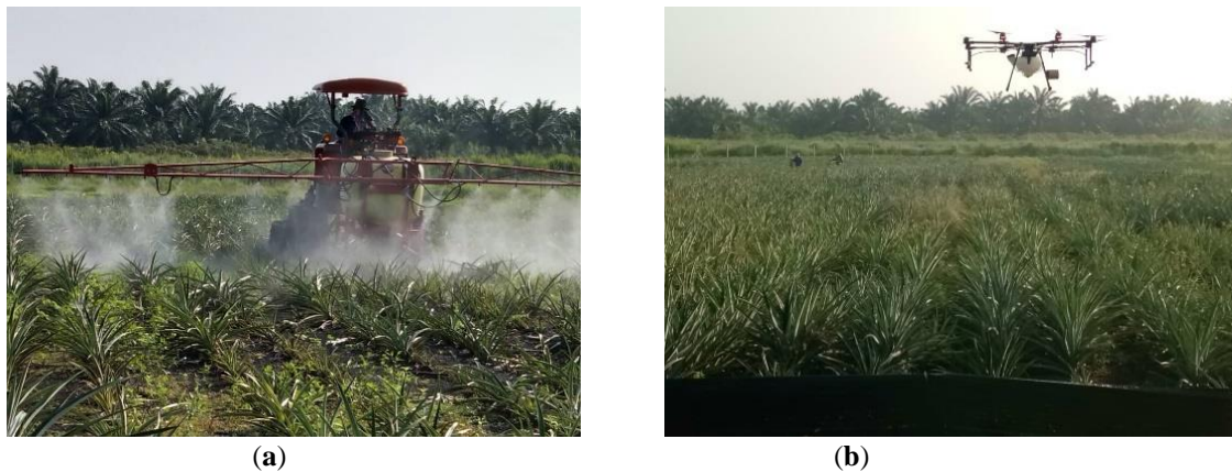
Figure 2. The applicators used in the study. (a) A boom spraying machine mounted on 38hp rubber track tractor; (b) Spraying drone