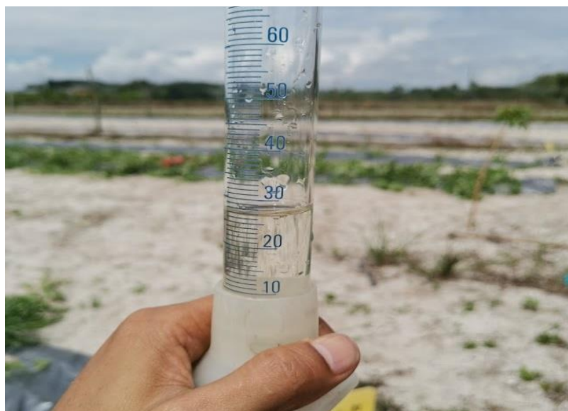
Figure 3. Measuring discharge using a measuring cylinder.

Hydraulic performance is calculated to obtain the actual performance of the irrigation system. The components involved in the calculation of hydraulic performance include the coefficient of uniformity (CU), emission of uniformity (EU), coefficient of variation (CV) and emitter flow variation (EFV). The classifications of hydraulic parameters are presented in Table 1.