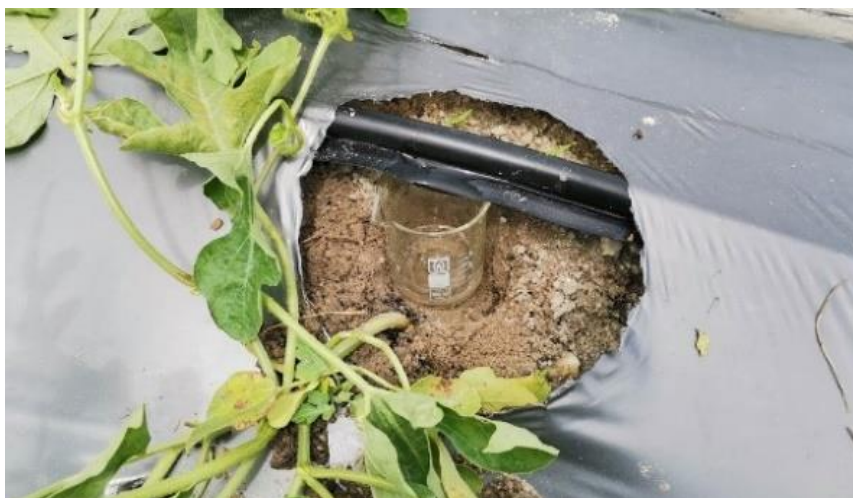
Figure 2. Discharge data collection.

Hydraulic performance is calculated to obtain the actual performance of the irrigation system. The components involved in the calculation of hydraulic performance include the coefficient of uniformity (CU), emission of uniformity (EU), coefficient of variation (CV) and emitter flow variation (EFV). The classifications of hydraulic parameters are presented in Table 1.