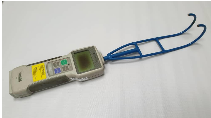
Figure 1. Digital force gauge meter with hook