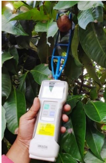
Figure 2. Mangosteen pulled by digital force gauge meter during the experiment