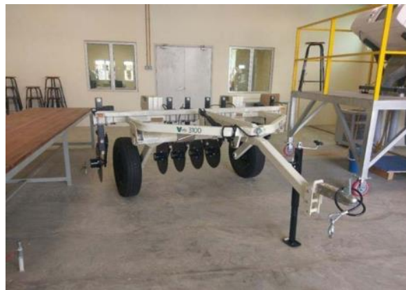
Figure 2. Veris 3100.

According to research done by Mohad Azhan et al. (2021), a soil EC mapping coordination using intelligence sensor at young oil palm planted area was carried out at Melaka by operating an auto-pilot system and Veris 3100 (Figure 2). The Veris 3100 has revolutionized soil EC measurement for farmers, enabling them to generate soil EC maps with precision. Veris, integrated with GPS technology, accurately locates the device before transforming the data into map format. However, any GPS malfunction can lead to data inaccuracies. Nevertheless, Veris 3100 is a reliable technology known for its ability to identify areas with specific soil properties using soil EC.